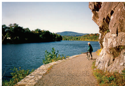
Scenic point above Dam #5 (Mile 107)