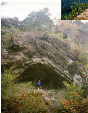
Devil's Eyebrow (Mile 124)