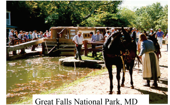
Great Falls National Park, MD

Plus Cumberland-Pittsburgh Option on Great Allegheny Passage Rail Trail