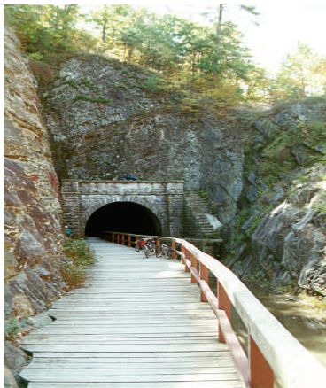
Paw Paw Tunnel (1842)(Mi. 155)