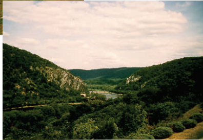
Potomac and Shenandoah Rivers View from Harpers Ferry, WV