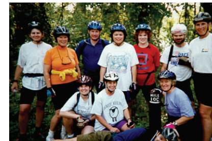
Some tour participants at mile 100

GAP option must have at least 8 participants.