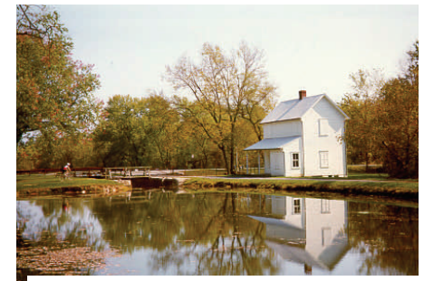
Lock and Lock House, Old Town, MD

Retrace the route of the C&O Canal by Mt. bike, from the earliest, history-rich section of Georgetown, DC, to the remote, scenic mountains.